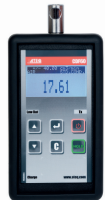
CDF 60 Leak/Flow Calibrator