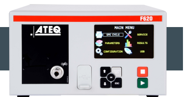
F620 compact case